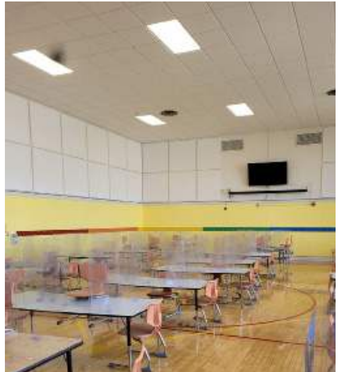
Walberta Park School Cafeteria