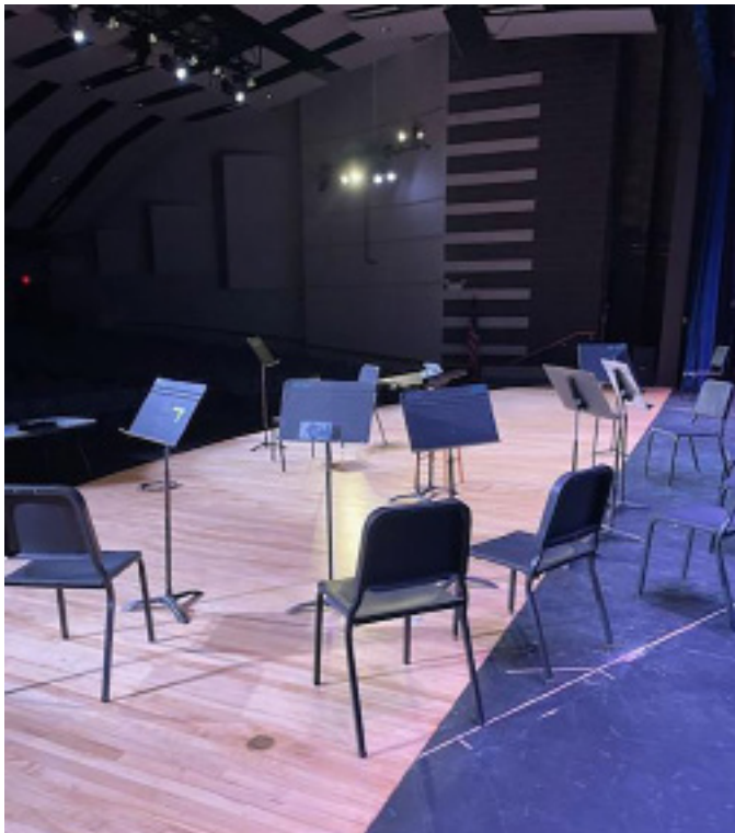
Westhill High School Stage

Bid documents are being prepared and the project is on track for SED approval in December 2021, with the project going out to bid in January 2022. Construction is scheduled to occur June 2022 – August 2023, closing out fall 2023.